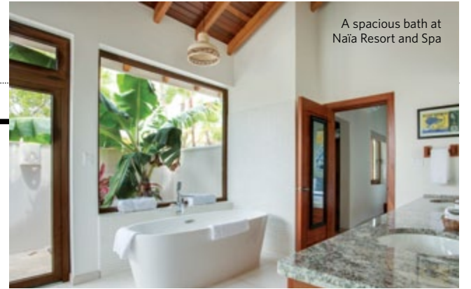
A spacious bath at Naïa Resort and Spa