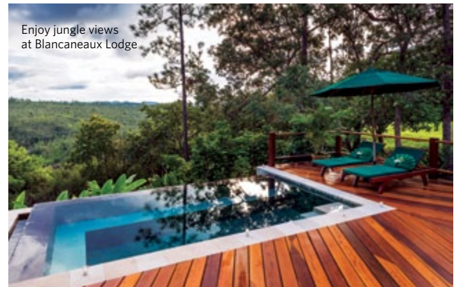
Enjoy jungle views at Blancaneaux Lodge