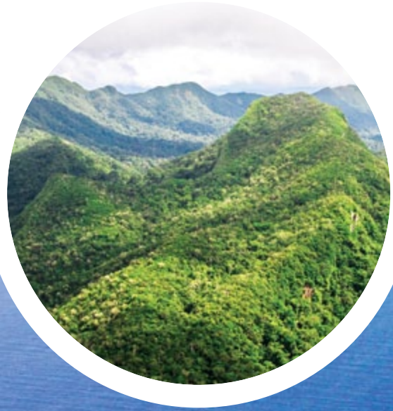
Lush tropical forests hug the country's southern and western regions